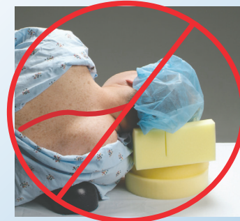
B ] Improper Alignment