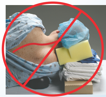
A ] Improvised Positioning