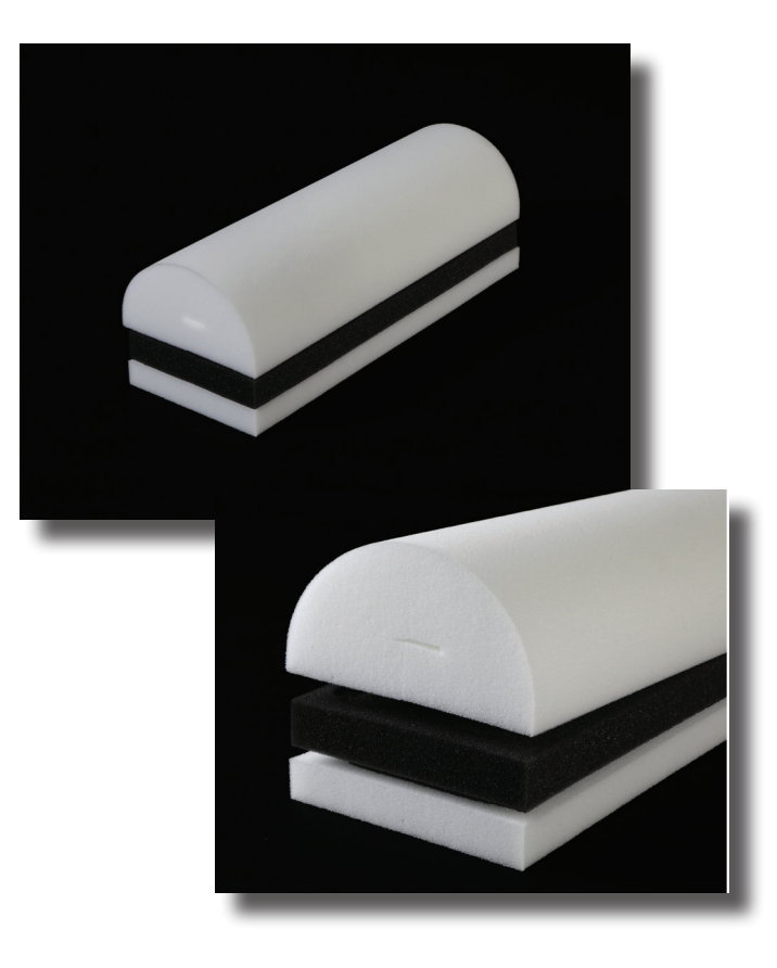
Dimensions: Ca 12.5" long x 4.5" wide x 4.75" high (.75" tear-away layers)